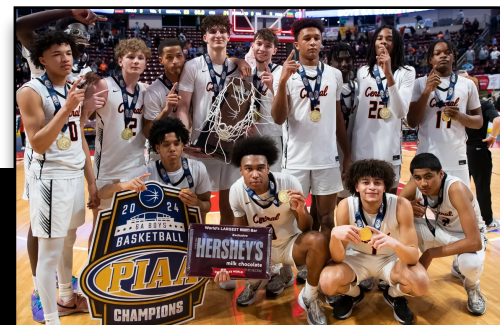
The 2023-2024 Central York Panthers pose for a team photo after winning the PIAA Class 6A Boys Basketball Championship against Parkland at the Giant Center on March 23, 2024, in Hershey. The Panthers won, 53-51, to capture their first title in program history.